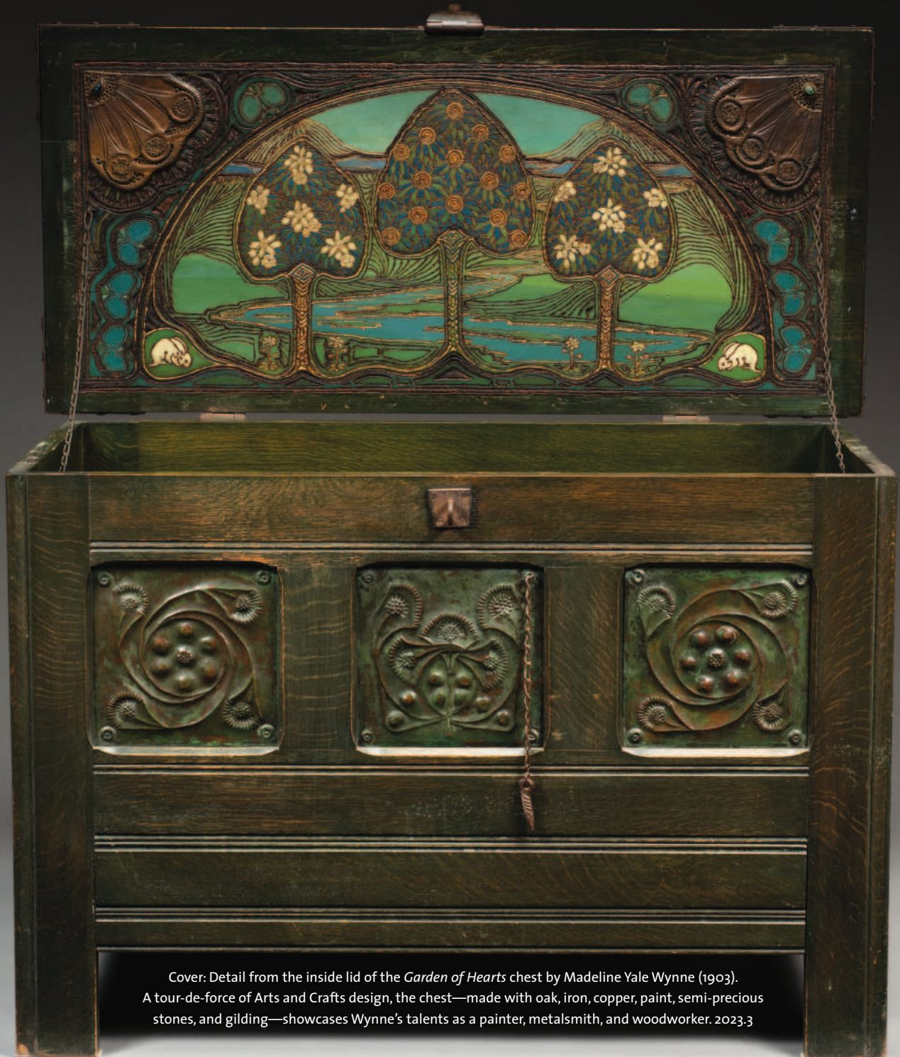
Cover: Detail from the inside lid of the Garden of Hearts chest by Madeline Yale Wynne (1903). A tour-de-force of Arts and Crafts design, the chest—made with oak, iron, copper, paint, semi-precious stones, and gilding—showcases Wynne’s talents as a painter, metalsmith, and woodworker. 2023.3

Historic Deerfield welcomes all to experience one of the best-preserved villages and rural landscapes in North America through dynamic encounters with the stories, cultures, and material worlds of those who have made New England home.