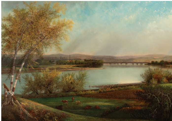
On the Banks of the Connecticut , detail, by Nelson Augustus Moore (1824–1902), Springfield, Massachusetts, 1870. Museum purchase with funds provided by a bequest from Joseph Peter Spang III in honor of the Flynt Family, 2023.13

when Massachusetts Jonathan Governor Belcher met with several Native American groups in 1735. To date, nearly 900 users have downloaded it.