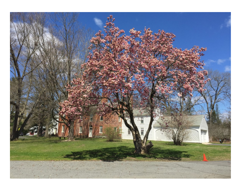
Magnolia tree in full bloom on the south lawn of the Asa and Emilia Stebbins House.

The village of Old Deerfield is also bursting with blooms in late April and early May. Here are a few images from a recent walk down Old Main Street.