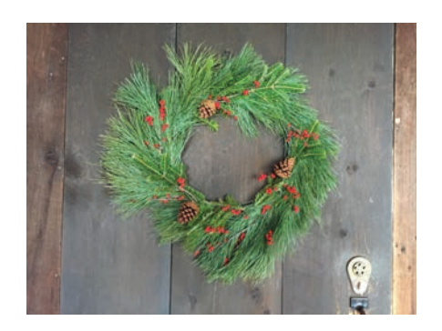
Hall Tavern (Guides' Lounge North Side Door)

Materials: Fraser fir, cones, winterberry